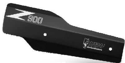
COVER IN ACCIAIO / STEEL COVER 50.CR.037.0