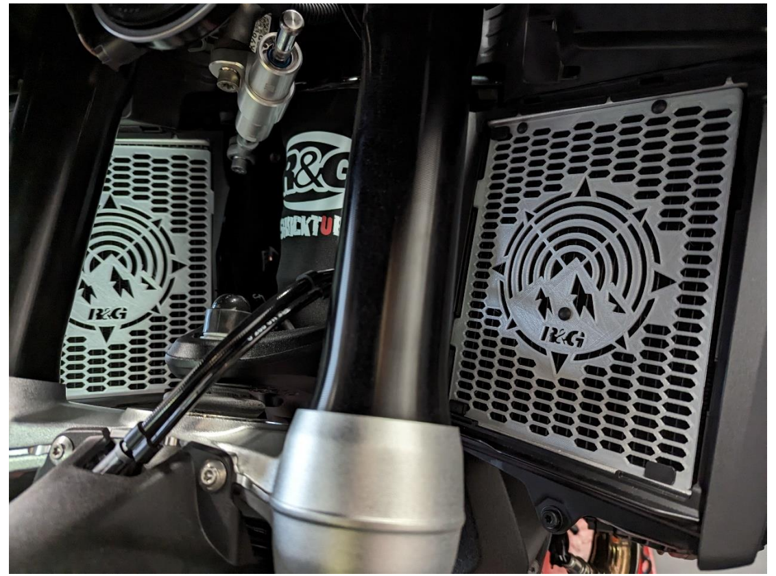
THIS KIT CONTAINS THE ITEMS PICTURED AND LABELLED OVER PAGE. SOME PARTS MAY BE SHOWN FOR CLARITY OF INSTRUCTIONS ONLY.

DO NOT PROCEED UNTIL YOU ARE SURE ALL PARTS ARE PRESENT.